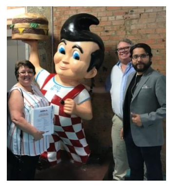
TMCA Team @ SPARK!

Date: Friday, October 26, 2018 | 8:30 AM-12:00 PM | Networking Breakfast at 8:00 Site: SPARK! | 1409 South Lamar, Suite 004, Dallas, Texas 75215 Facilitators: SPARK! and Trammell McGee-Cooper & Associates